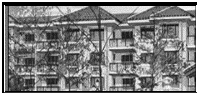
MISSIONWOOD 1075 Barnes Avenue, Kelowna