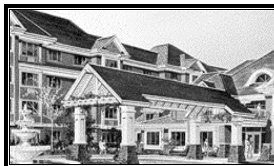
SANDALWOOD 580 Yates Road, Kelowna