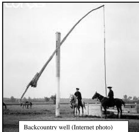
Backcountry well

Patricia was inspired by a picture sent to her by one of her friends, which gave her the idea. She loves blue and she loved the blue traditional costume the cowboy is wearing. She commented: ... “In the back country it's common to find this type of well to give water to the cattle. The long stick of wood is used as balance to bring down an empty bucket and bring up the bucket with water.” What you see is a typical Hungarian folkloristic picture with the (blue) cowboy, the landscape and the well.