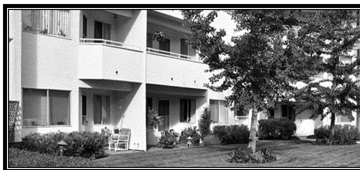
OKANAGAN CHATEAU 21 Benvoulin Court, Kelowna

ATTENTION ALL MEMBERS Please direct inquiries about courses, missed sessions or attendance to the appropriate Study Group Leaders, Co-Leaders or Study Group Coordinators and NOT to the SLR Office. Phone numbers are posted in the Courses Section. Thank you.